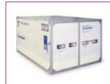
ENVIROTAINER (RAP) Refrigerated container -20°C/+20°C