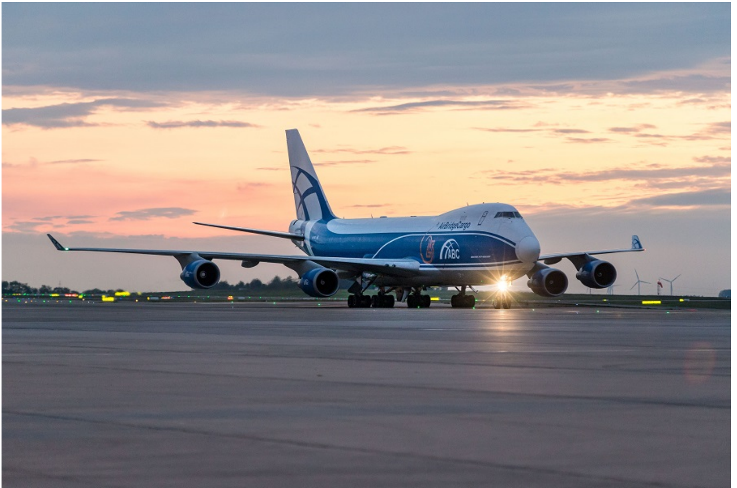
ABC BRINGS LIEGE INTO FOLD