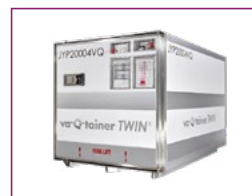
VA-Q-TAINER TWINx Passive container -70°C/+25°C