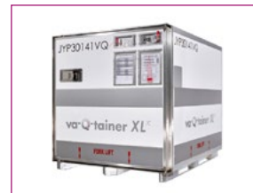
VA-Q-TAINER (XLX, TWINX) Passive container -70°C/+25°C