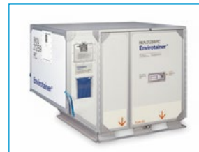
ENVIROTAINER T2 (RKN) Refrigerated container -20°C/+20°C