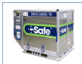
C-SAFE (RKN) +4°C/+25°C