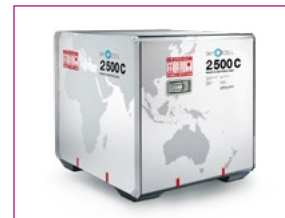
SKYCELL (2500C, 2500CRT, 1500C, 1500CRT, 770C, 770CRT) Passive container +2°C/+25°C

AirBridgeCargo offers different types of comprehensive solutions for temperature-sensitive cargo, using active and passive containers.