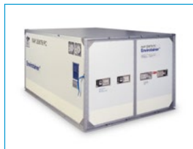
ENVIROTAINER T2 (RAP) Refrigerated container -20°C/+20°C