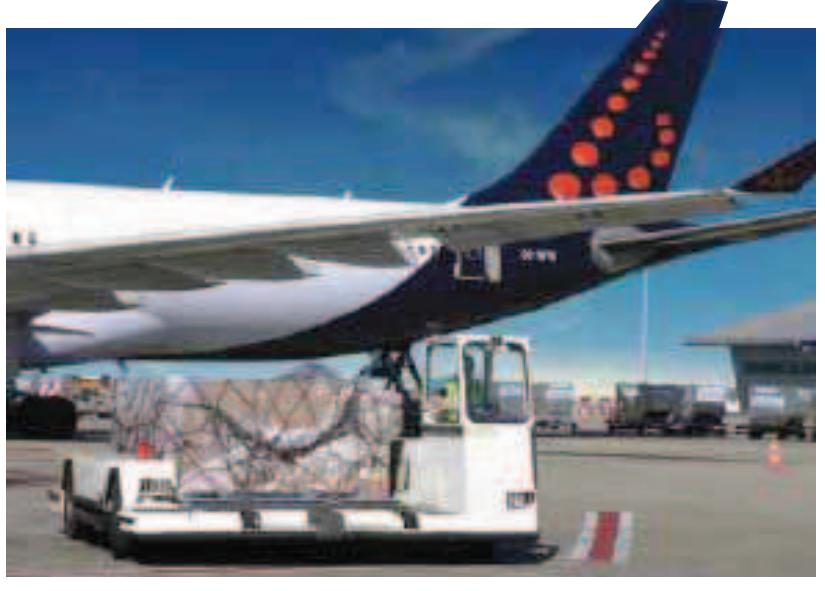
Brussels Airlines pharma transport activities grew by 56% in 2017

"Ever since the industry started using a broad range of special handling codes for pharmaceutical goods, pharma has become more easily identifiable. This helped us track the flows through our facilities," he adds. ►