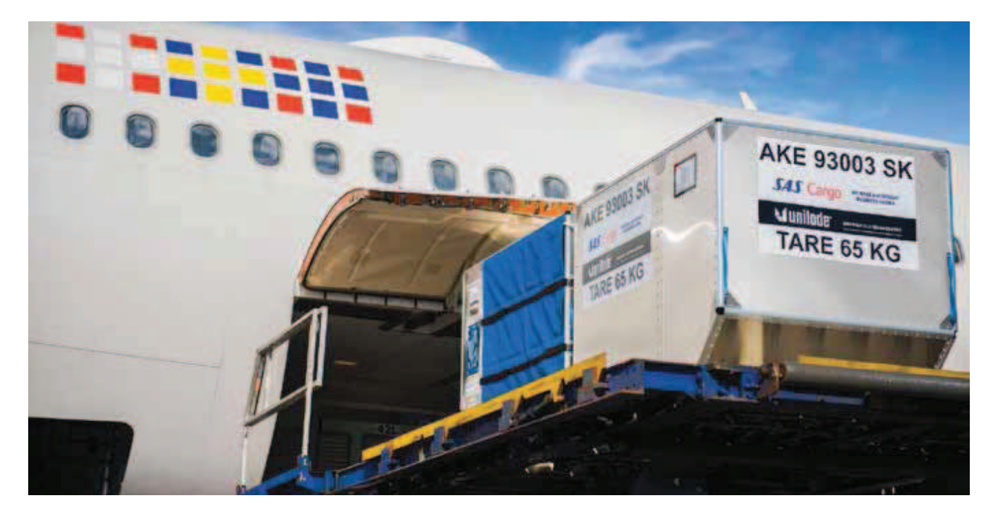
SAS is strategically placed for phama transport

The whole process of CEIV certification includes five stages: preparation, assessment, validation, training and certification. While preparation deals with documentary side from both parties (IATA and the carrier being certified), assessment and validation are the most active stages and cover on-site assessment (against minimum IATA temperature-controlled checklist), establishment