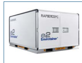
ENVIROTAINER E2 (RAP) -20°C / 20 °C