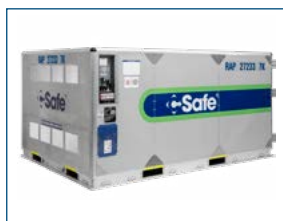
C-SAFE (RAP) +4°C/+25°C