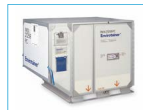
ENVIROTAINER T2 (RKN) Refrigerated container -20°C/+20°C