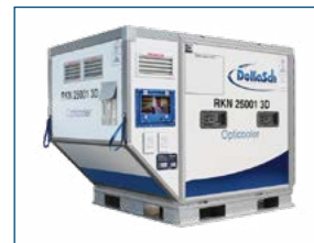
DOKASCH (RKN) +2°C/+30C