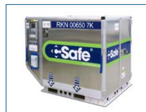
C-SAFE (RKN) +4°C/+25°C