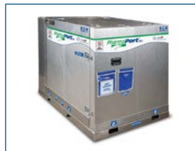
SONOCO THERMOSAFE PHARMAPORT® 360 Precise 5°C Temperature Control