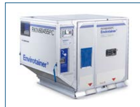
ENVIROTAINER E1 (RKN) 0°C/+25°C