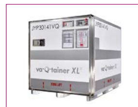
VA-Q-TAINER (XLX, TWINX) Passive container -70°C/+25°C