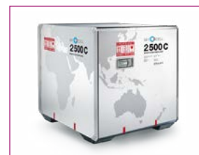
SKYCELL (2500C, 2500CRT, 1500C, 1500CRT, 770C, 770CRT) Passive container +2°C/+25°C

AirBridgeCargo offers different types of comprehensive solutions for temperature-sensitive cargo, using active and passive containers.