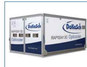
DOKASCH (RAP) +2°C/+30C