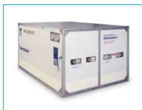
ENVIROTAINER T2 (RAP) Refrigerated container -20°C/+20°C